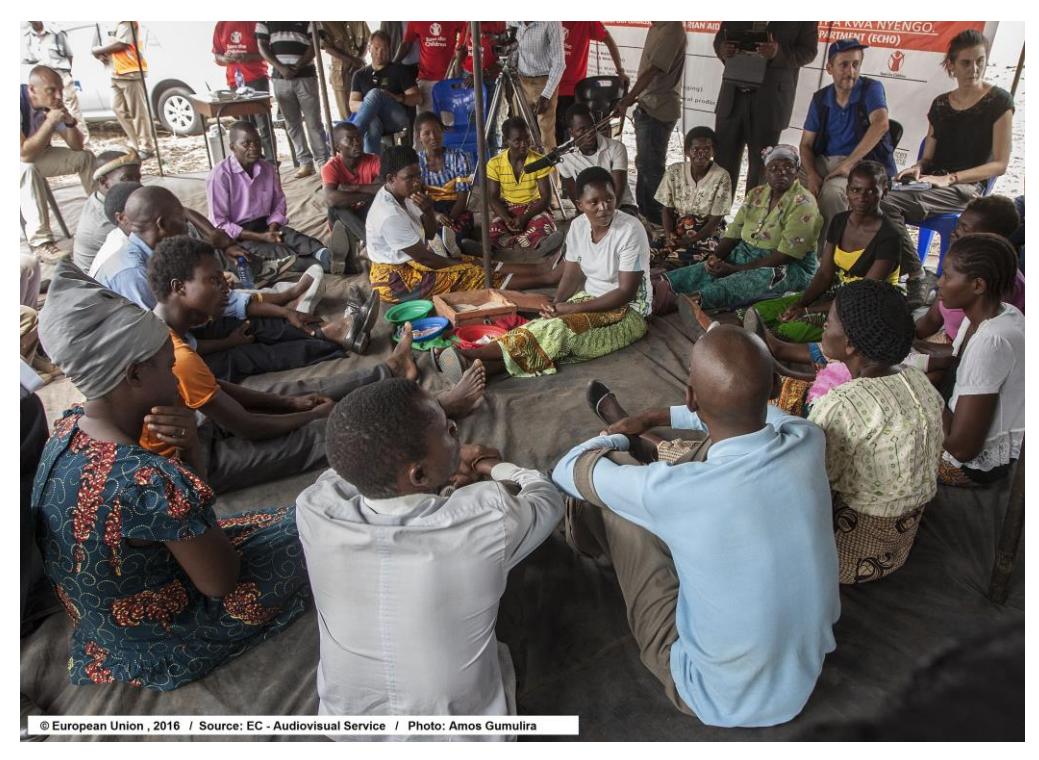
Group meeting in Malawi with members of Village Savings and Loan Association (VSL), international NGOs and EC representatives.

The second purpose is to review the practice of local ownership through the prism of a Whole of Society approach to conflict prevention and peacebuilding. In this regard the report draws on fieldwork conducted in Ukraine and the Community of Practice roundtable discussion held in Kiev among practitioners, policy-making and academic representatives.