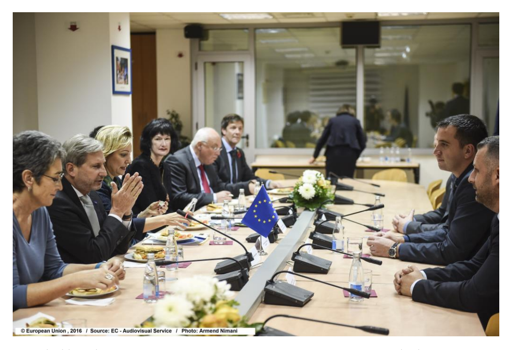
Round table with Branimir Stojanović, Deputy Prime Minister of Kosovo, and Johannes Hahn, Member of the EC in charge of European Neighbourhood Policy and Enlargement Negotiations.

These adaptations also negatively affected the legitimacy of EULEX in Kosovo. It became a 'status neutral' mission – something that was not appreciated by Kosovo's political leadership and population. This shows that not only the expectations of the EU are relevant to assessing its capabilities, but the expectations and perceptions of local leaders and people also have an impact. National political leaders generally had to accept the EULEX mission, but it is fair to say that they were more interested in support for Kosovo's independence and prospects of EU accession. Many Kosovar citizens were sceptical about EULEX's capacity to fight corruption and to 'catch the big fish', and generally not happy with the mission punishing its 'war heroes'.