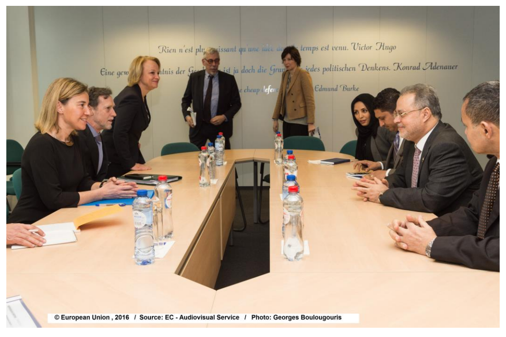
Federica Mogherini, High Representative of the Union for Foreign Affairs and Security Policy and Vice-President of the EC, received Abdulmalik Al-Mekhlafi, Yemeni Deputy Prime Minister and Minister for Foreign Affairs.

This report, with its special focus on the NDC, offers valuable insight into strengths and weaknesses of EU's contribution to Yemen's transition process in regards to MTD and provides further insight into the conflict background and international interventions.