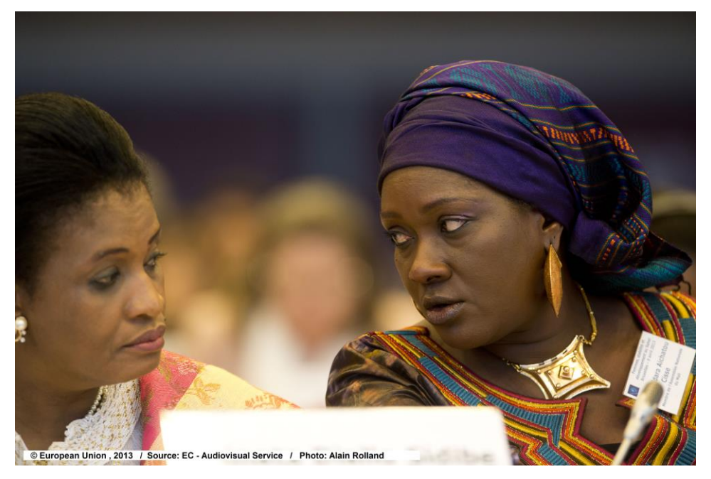
Conference on Women's Leadership in the Sahel that brought together 40 women, civil society leaders of several generations, peace and security experts, peace activists, government officials and gender equality advocates from the Sahel region.

MTD is an entry point with enormous potential for the EU to engage with gender in wider peacebuilding and conflict prevention efforts, as it can have a positive impact in other areas such as Security Sector Reform (SSR) and Governance reform as a result of its specific inclusion in peace negotiations and agreements. Moreover, the EU's range of actors and their vast geographical presence create windows of opportunity which in several cases can be taken advantage of more effectively.