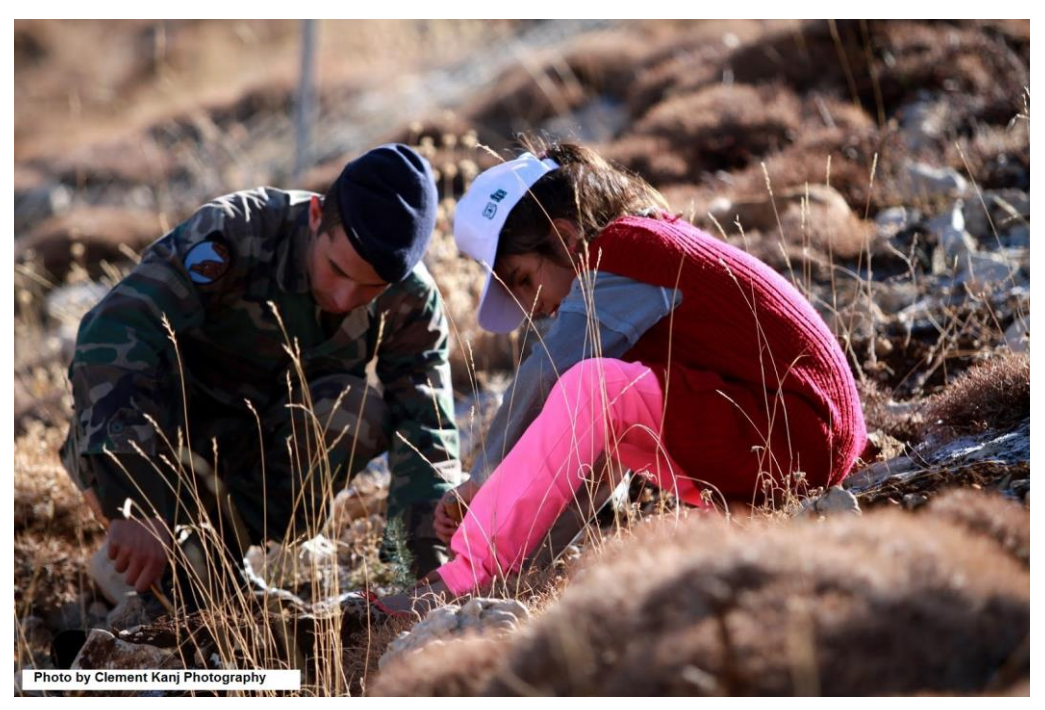
A young girl plants a cedar tree with a Lebanese Army officer in Bcharre-Lebanon (northern region) during a 2013 reforestation campaign.

Based on practitioners' first hand field level experiences, civil-military synergies are more likely to occur in short term missions (i.e., stabilization) with clearly defined mission goals, often carried out in a less crowded operational environment and under a clear command structure and leadership. Grounded in the key learning from these short term missions, practitioners underline the need for improved resources (materially, financially as well as human) and their timely mobilization and flexibility of deployment. They regard processes of coordination, cooperation and coherence of the EU's capabilities throughout the operational cycle of a mission and beyond, as key for fostering civil-military synergies at the operational level. From a practice perspective, setting smaller aims and corresponding steps as well as action points enable situations of effective civil-military interfaces. Further, trust building and networking in regular and complex mission environments were identified as an important precondition for civil-military synergy at the operational level.