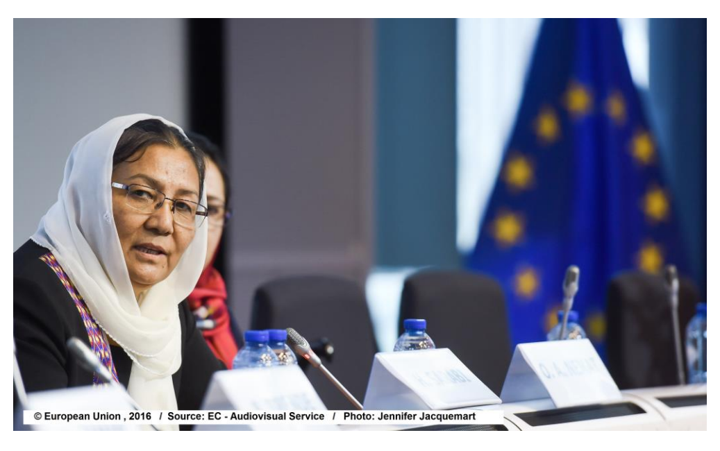
Habiba Sarabi, Deputy Chairperson of the Afghanistan High Peace Council (HPC) speaking at the conference "Empowered women, prosperous Afghanistan".